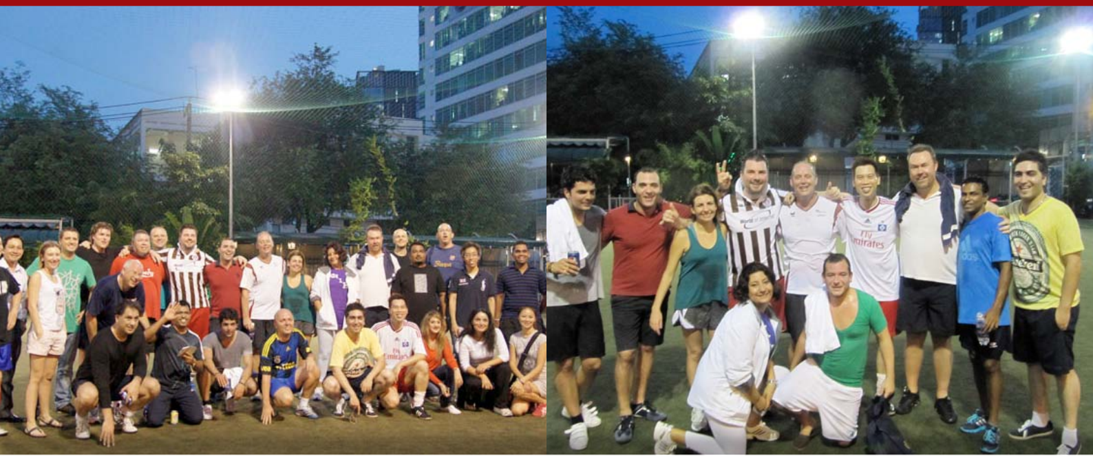
THE TEAMS AND THEIR SUPPORTERS