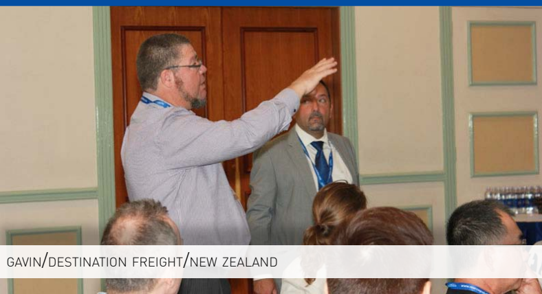
GAVIN/DESTINATION FREIGHT/NEW ZEALAND