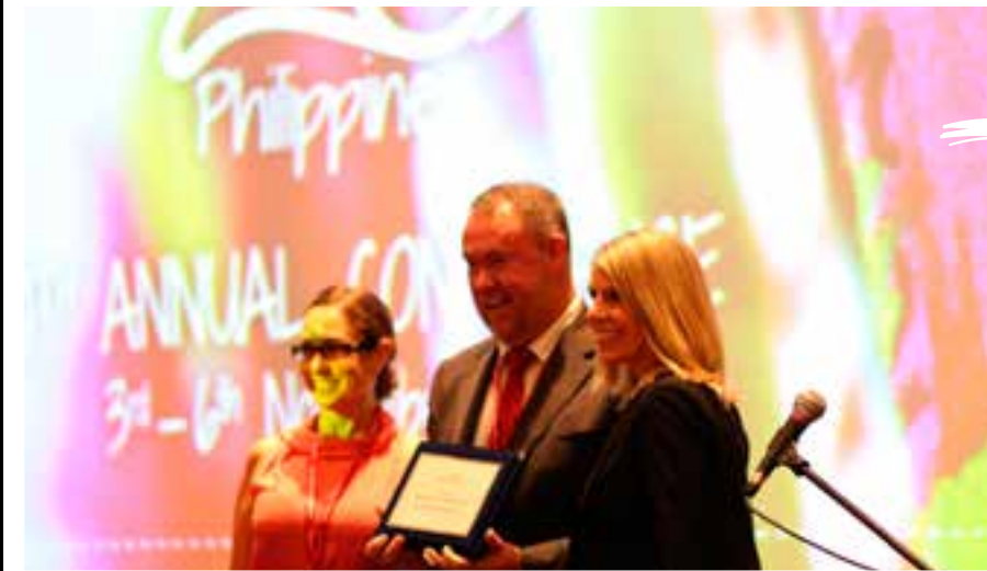
UCM/USA RECEIVING AWARD FOR BEST BONUS SCHEME PARTICIPANT