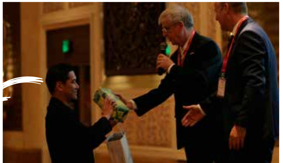
LEON OF LF GLOBAL RECEIVING A GIFT FOR HIS HARD WORK AS HOST