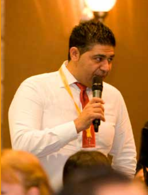
OREN COHEN CASPI CUSTOMS AGENTS & INTERNATIONAL FORWARDING - ISRAEL