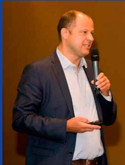
RAF HERMANN FLEXITANKS