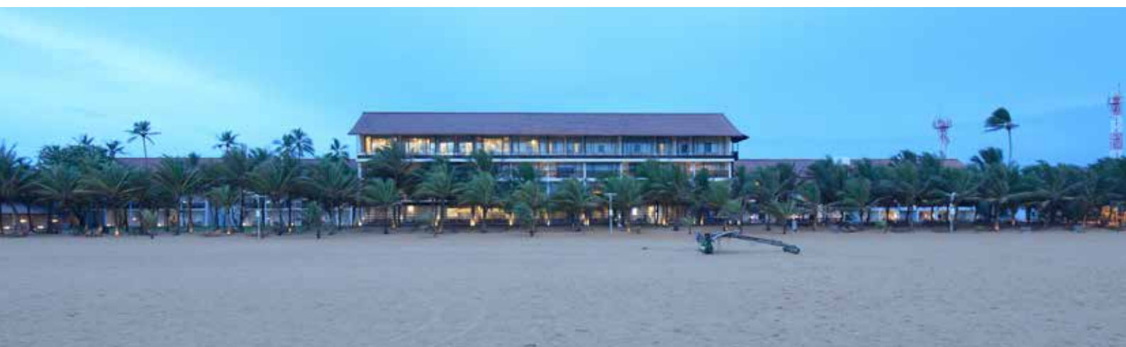
EVENING VIEW OF THE BACK OF THE HOTELS JETWING BLUE AND JETWING BEACH

AS OUR CONFERENCE IS ALMOST FULL sophie@marcopololine.com